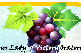
Our Lady of Victory Oratory