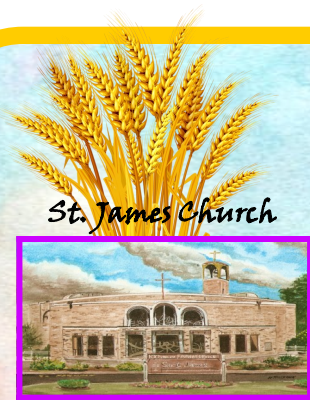
St. James Church