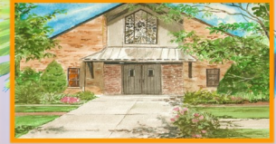
Our Lady of Victory Cratory