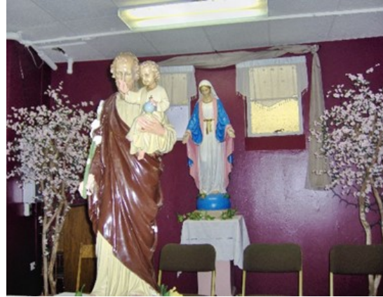
St Joseph Table 2010