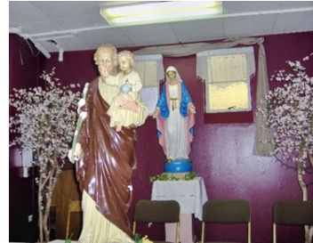
St Joseph Table 2010